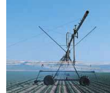
Travelling Sprinkler System (Pivot systems)