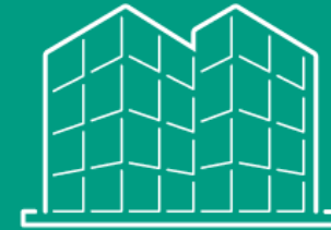
BUILDING SERVICES COMMERCIAL