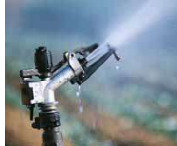
Fixed Sprinkler System