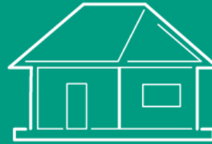
BUILDING SERVICES RESIDENTIAL